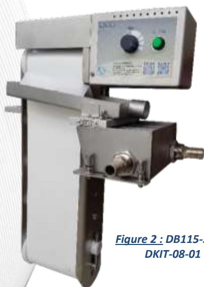
Figure 2 : DB115-300 + DKIT-08-01